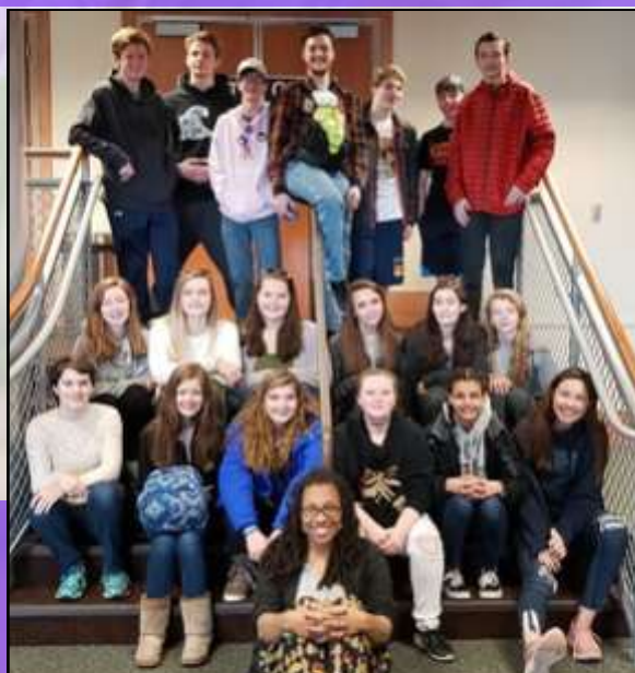
Youth Group at ROCK 2019 in Ocean City, Maryland