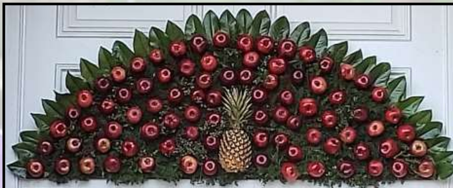
A ‘Williamsburg Welcome’ hangs above church doors