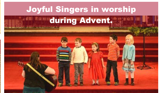
Joyful Singers in worship during Advent.