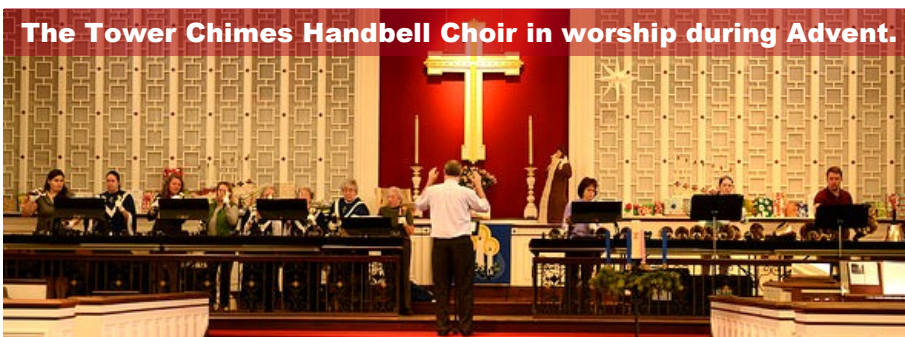
The Tower Chimes Handbell Choir in worship during Advent.