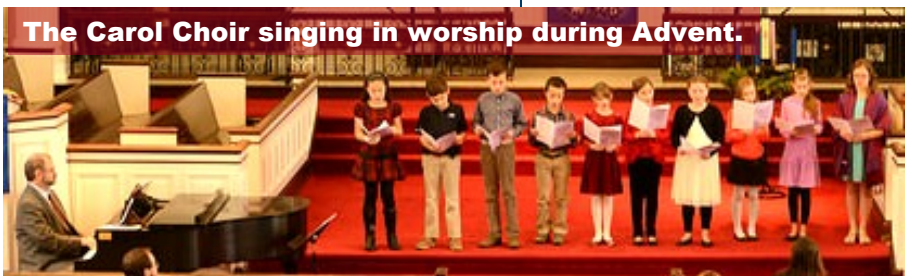
The Carol Choir singing in worship during Advent.