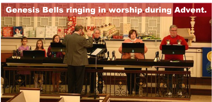
Genesis Bells ringing in worship during Advent.