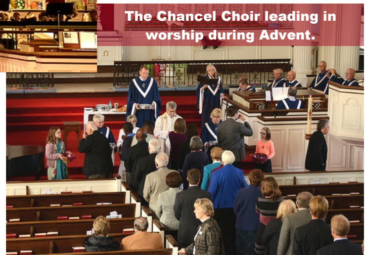
The Chancel Choir leading in worship during Advent.